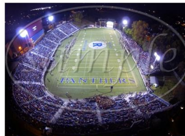
FRIDAY NIGHT LIGHTS